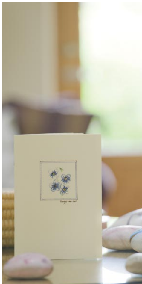
ABOVE: THE ORDER OF SERVICE INCLUDES PRAYERS, SONGS AND READINGS TO REMEMBER THE CHILDREN WHO HAVE DIED.

Although their child has died, their memories stay alive. One mum comes across from France because it's so important to her.