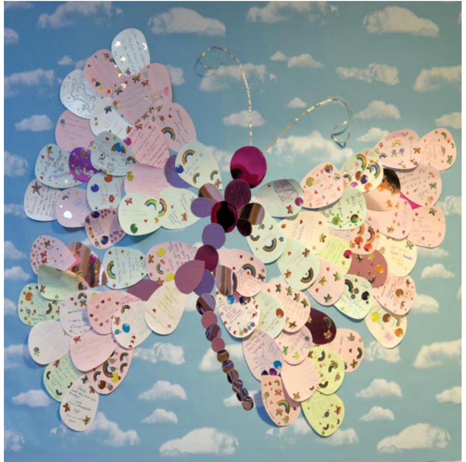
ABOVE: FAMILIES WROTE MESSAGES TO THEIR LOVED ONES TO CREATE THE WINGS OF A DRAGONFLY DURING REMEMBERING DAYS. THE DRAGONFLY IS SYMBOLIC AS THE STORY 'WATER BUGS AND DRAGONFLIES' IS USED TO HELP EXPLAIN DEATH TO CHILDREN.

The Remembering Days are part of the healing process. Last year over 300 people attended services held over two days at each hospice, Rachel House and Robin House.